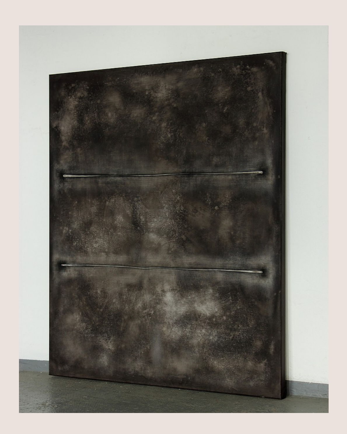
TENSION N° 2