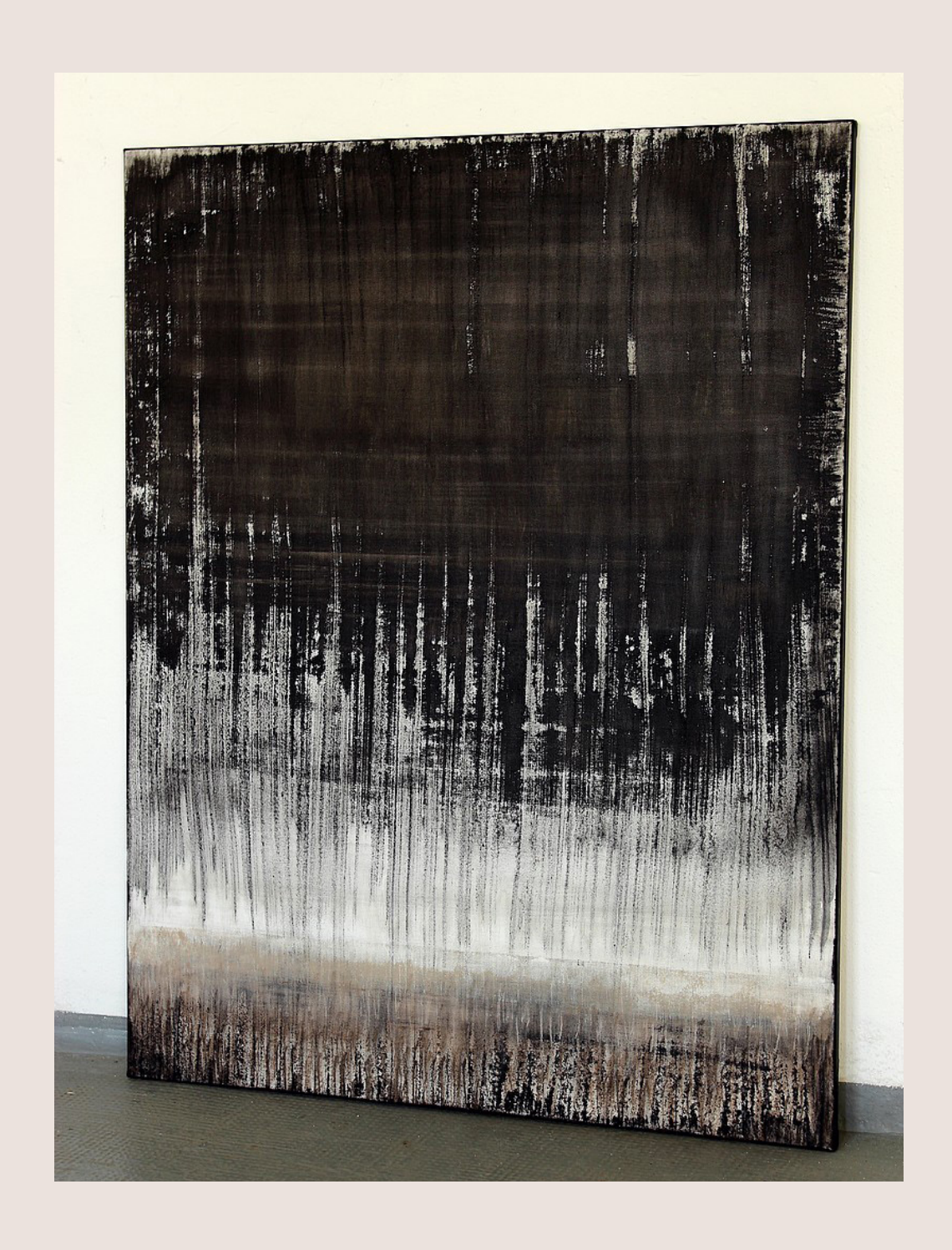
TEXTURED BLACK BROWN_WHITE