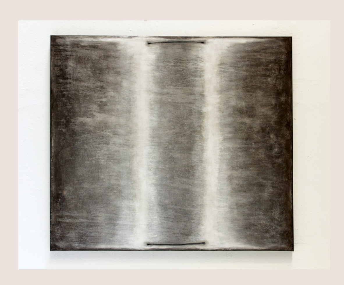
1591 TENSION BUILD